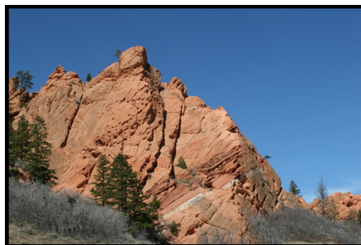
Majestic red rocks at Aspiro base in Hanna,